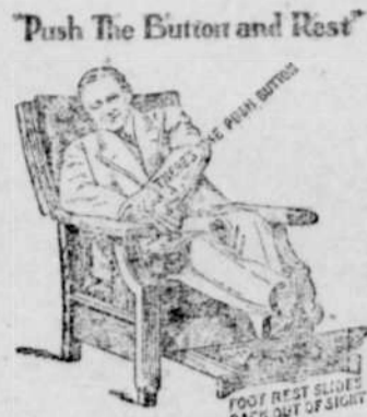
Royal Easy Chairs

$24.75 Buys a good steel range with high warming oven, burns coal or wood--a guaranteed baker.