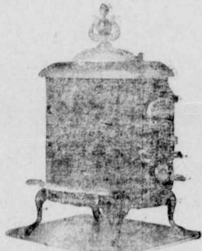
The Perfect Stove "CHEERFUL"

That's gratifying to us and leads us to still greater efforts to make this Store more than ever "Young Store" for service. Here are some of the things that count: A Stock so complete that we feel safe in saying, you'll not find it's equal--and Prices positively 20% to 40% lower than Portland or any other Western city. Lower, even, than the widely heralded Mail Order "junk." We want you to make us prove these statements. We are doing it for others every day.