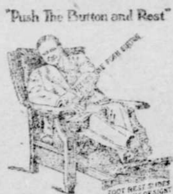
Royal Easy Chairs

$24.75 Buys a good steel range with high warming oven, burns coal or wood—a guaranteed baker.