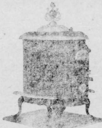
The Perfect Stove "CHEERFUL"

That's gratifying to us and leads us to still greater efforts to make this Store more than ever "Your Store" for service. Here are some of the things that count: A Stock so complete that we feel safe in saying, you'll not find it's equal—and Prices positively 20% to 40% lower than Portland or any other Western city. Lower, even, than the widely heralded Mail Order "junk." We want you to make us prove these statements. We are doing it for others every day.