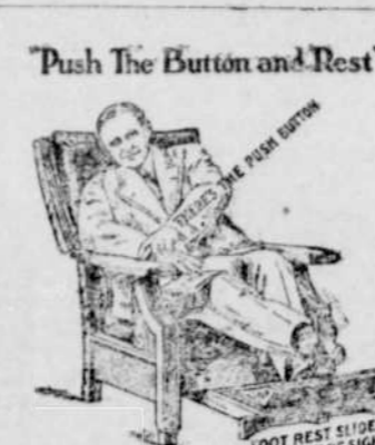
Push The Button and Rest "Royal Easy Chairs" Furniture and Rugs No city store excels our display. We invite your inspection, whether you wish to buy or not. Make our Store your headquarters when in Hood River—There are plenty of restful chairs at your service. A Rest Room is provided for women and children.