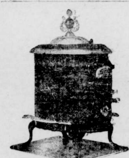
The Perfect Stove "CHEERFUL" More in use in this locality than anywhere else. $11.25 to $15.75

That's gratifying to us and leads us to still greater efforts to make this Store more than ever "Your Store" for service. Here are some of the things that count: A Stock so complete that we feel safe in saying, you'll not find it's equal—and Prices positively 20% to 40% lower than Portland or any other Western city. Lower, even, than the widely heralded Mail Order "junk." We want you to make us prove these statements. We are doing it for others every day.