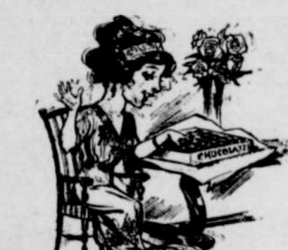
TREAT INDEED! is a box of our chocolates or bonbons. No candy could be better at any price. None could be more delicately flavored or more attractively packed. If you want to please her for fair, buy her a box today.