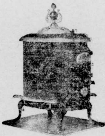
The Perfect Stove "CHEERFUL"

That's gratifying to us and leads us to still greater efforts to make this Store more than ever "Your Store" for service. Here are some of the things that count: A Stock so complete that we feel safe in saying, you'll not find it's equal—and Prices positively 20% to 40% lower than Portland or any other Western city. Lower, even, than the widely heralded Mail Order "junk." We want you to make us prove these statements. We are doing it for others every day.