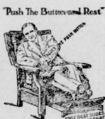
Royal Easy Chairs

$24.75 Buys a good steel range with high warming oven, burns coal or wood—a guaranteed baker.