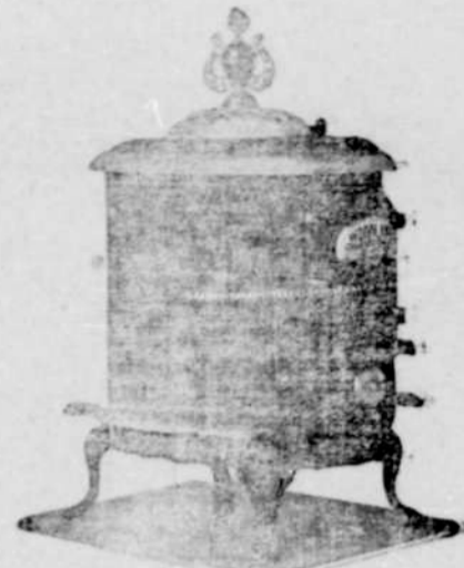
The Perfect Stove "CHEERFUL"

That's gratifying to us and leads us to still greater efforts to make this Store more than ever "Your Store" for service. Here are some of the things that count: A Stock so complete that we feel safe in saying, you'll not find it's equal--and Prices positively 20% to 40% lower than Portland or any other Western city. Lower, even, than the widely heralded Mail Order "junk." We want you to make us prove these statements. We are doing it for others every day.