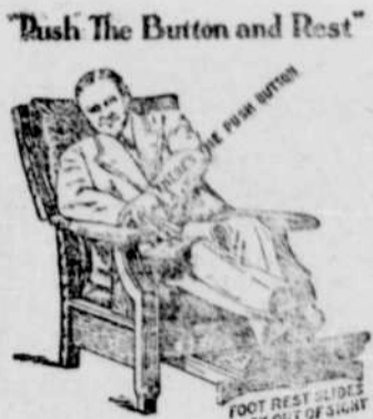
Royal Easy Chairs

$24.75 Buys a good steel range with high warming oven; burns coal or wood--a guaranteed baker.