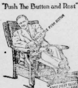
"Push The Button and Rest"

$24.75 Buys a good steel range with high warming oven, burns coal or wood--a guaranteed baker.