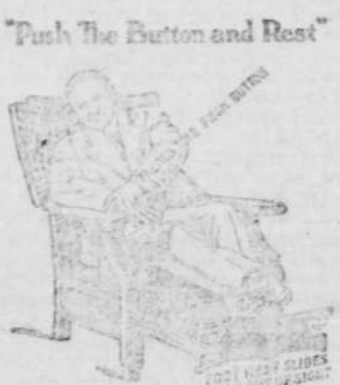
Royal Easy Chairs

You'll be asked to pay $10.00 more in any other store in Oregon. $24.75 Buys a good steel range with high warming oven, burns coal or wood--a guaranteed baker.