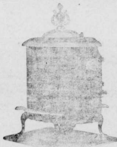
The Perfect Stove "CHEERFUL"

That's gratifying to us and leads us to still greater efforts to make this Store more than ever "Your Store" for service. Here are some of the things that count: A Stock to complete that we feel safe in saying, you'll not find it's equal--and Prices positively 20% to 40% lower than Portland or any other Western city. Lower, even, than the widely heralded Mail Order "junk." We want you to make us prove these statements. We are doing it for others every day.