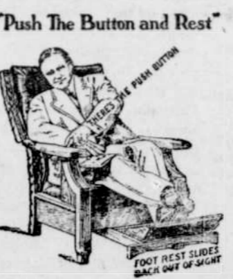
Push The Button and Rest

$24.75 Buys a good steel range with high warming oven, burns coal or wood—a guaranteed baker.