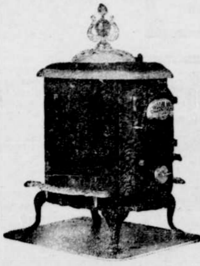
The Perfect Stove "CHEERFUL"

That's gratifying to us and leads us to still greater efforts to make this Store more than ever "Your Store" for service. Here are some of the things that count: A Stock so complete that we feel safe in saying you'll not find it's equal—and Prices positively 20% to 40% lower than Portland or any other Western city. Lower, even, than the widely heralded Mail Order "junk." We want you to make us prove these statements. We are doing it for others every day.