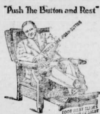
Royal Easy Chairs

$24.75 Buys a good steel range with high warming oven, burns coal or wood—a guaranteed baker.