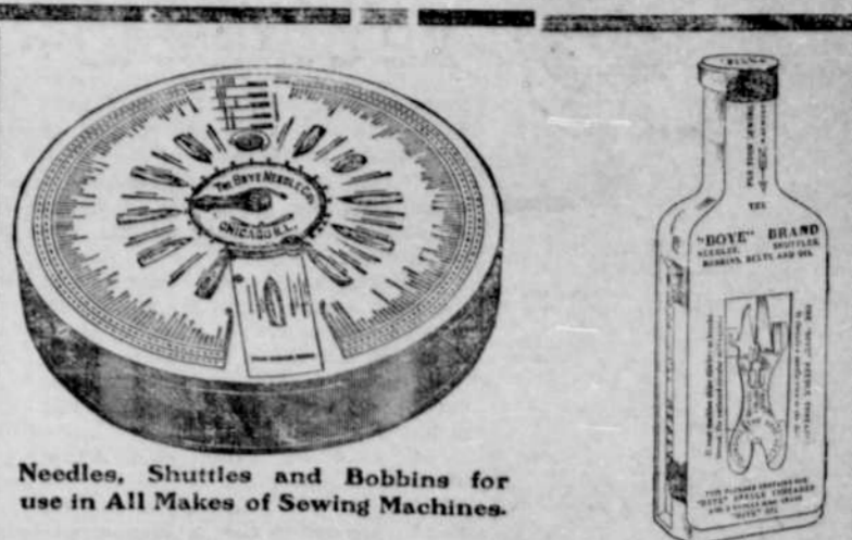
Needles, Shuttles and Bobbins for use in All Makes of Sewing Machines.

We can supply you with any needle to fit any sewing machine; also the best machine oil.