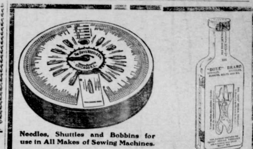
Needles, Shuttles and Bobbins for use in All Makes of Sewing Machines.

We can supply you with any needle to fit any sewing machine; also the best machine oil.