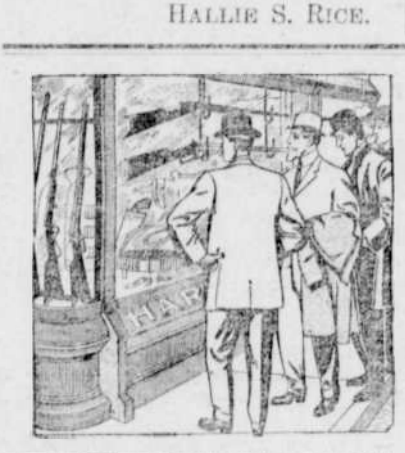
WHEN MEN SEE OUR GUNS they immediately begin to think of a day in the woods and a full game bag at night. But don't stop at looking. Come right in this hardware store and examine our guns in your own hands. Heft them, balance them, sight them. If that don't complete your satisfaction, the prices will.