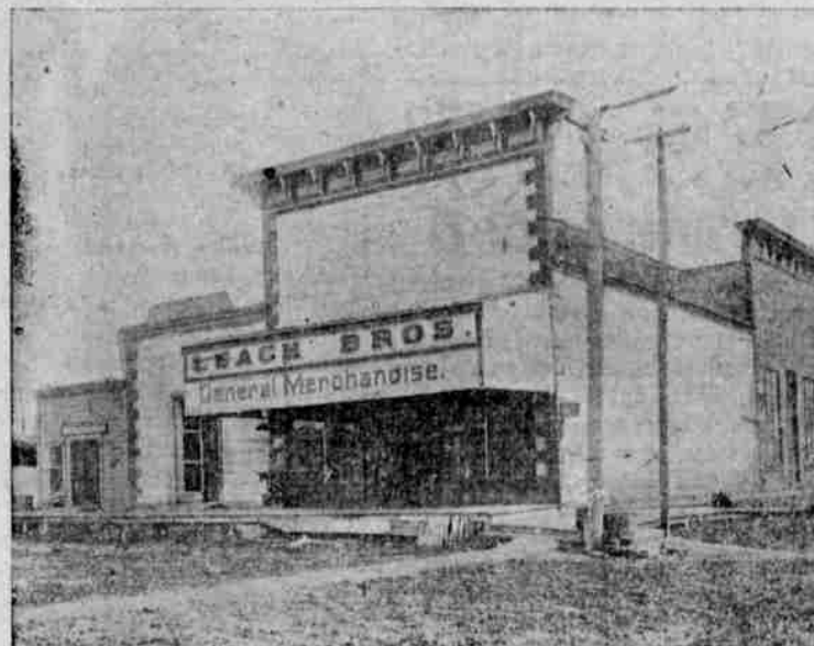
LEACH BROTHERS, GENERAL MERCHANDISE STORE