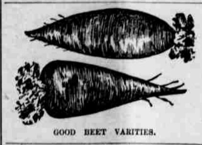
GOOD BEET VARIETIES.

Excellent Sugar Beets. Those who have raised beets for sugar know the value of the two varieties shown in the illustration. The one on the right is the famous Klein Wanzelben sugar beet; the other the Imperial. The first named is largely planted for sugar making, and they are rich in sugar. The Imperial is also a good sugar beet for sugar making. In this item, however, attention is called to these two sorts as being especially valuable to raise for the winter feeding of stock and especially of the cow. Being rich in sugar, they will supply much food matter, and at the same time give the needed amount of green or succulent food so much needed by cows during the winter. Neither variety is especially new, but they have