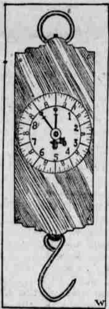
SCALE FOR TESTING.

Records of the performances of dairy cows form the only accurate and safe basis for judging their value. It is the constant aim of progressive dairymen to improve their herds, and such improvement must depend largely upon