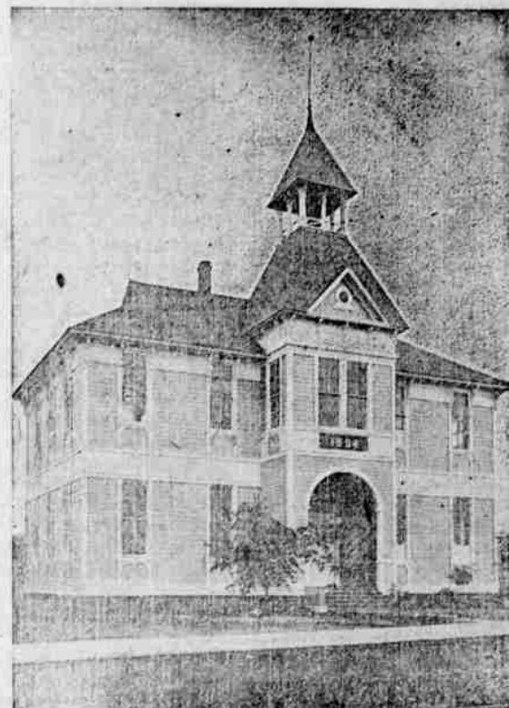
LEXINGTON PUBLIC SCHOOL

Let us not be afraid of exaggerating the advantage of our State. Let us tell the truth, and let us invite in this personal way our friends to come to Oregon. It will fill up our State with the very best class of people, and give unto us citizens who love to live under Christian influences and believe in good government."