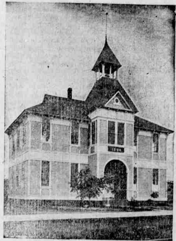
LEXINGTON PUBLIC SCHOOL