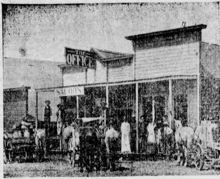
THE OFFICE SALOON AND GENTRY'S BARBER SHOP