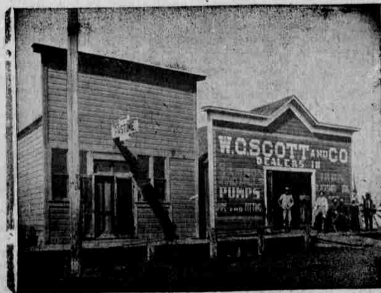
W. G. SCOTT & CO., BLACKSMITHS AND MACHINISTS

Loans made at Eight per cent. Four per cent. interest paid on Time Deposits.