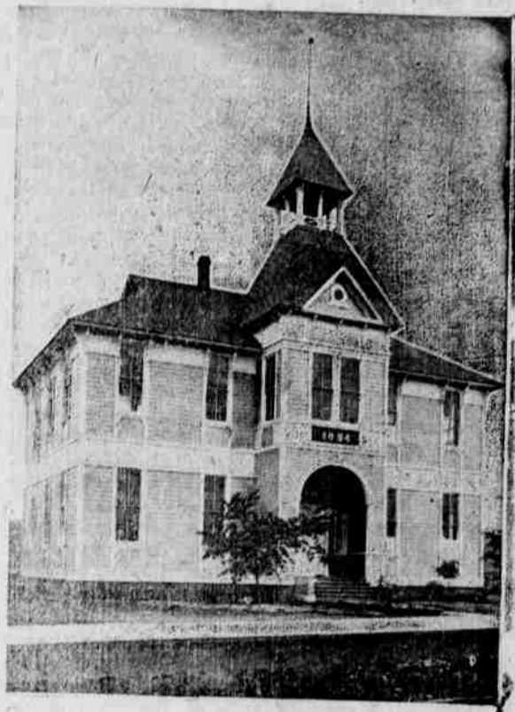
LEXINGTON PUBLIC SCHOOL