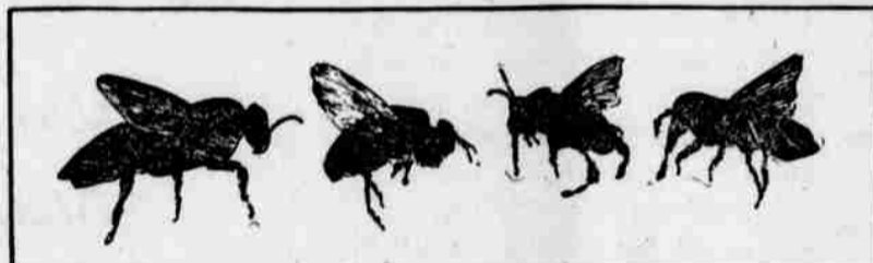
Italian Queen Bee. Italian Drone. Stingless Worker. Italian Worker.

To-day bee culture is almost an exact science. There is money in the business and the question is often asked: "What are the profits of beekeeping?" They vary from less than nothing (when the bees must be fed, because the weather is such that no crop has been gathered) to amounts that are fabulous. One colony, and its increase,