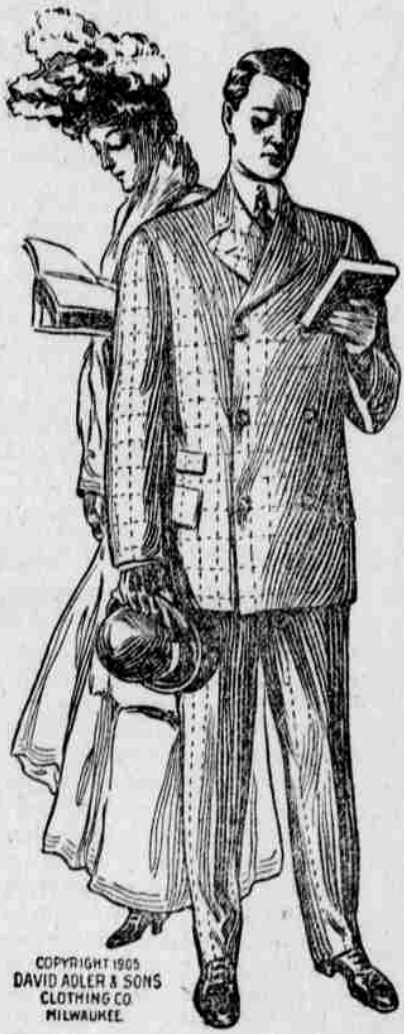
COPYRIGHT 1905 DAVID ADLER & SONS CLOTHING CO MILWAUKEE