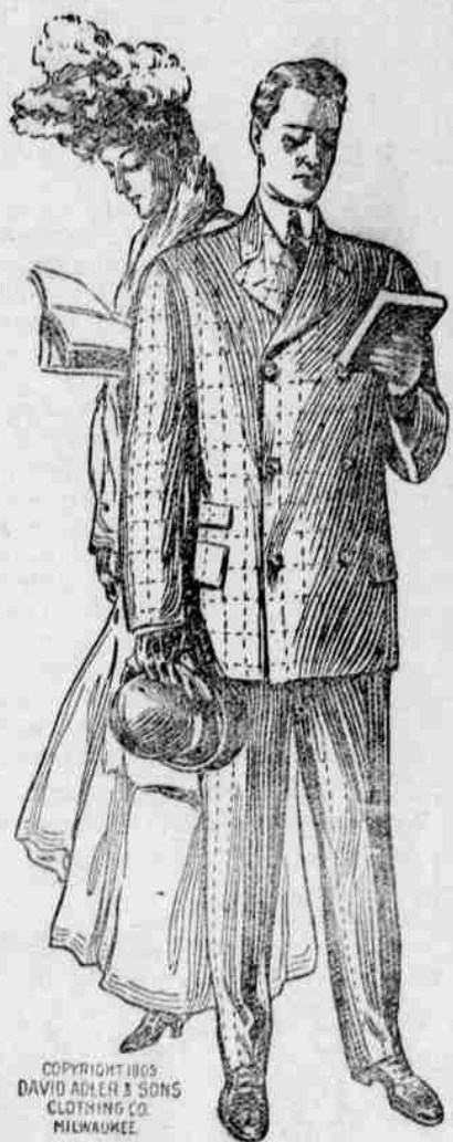
COPYRIGHT 1905 DAVID ADLER & SONS CLOTHING CO. MILWAUKEE