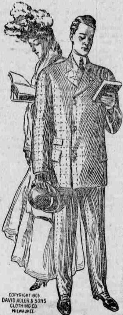
COPYRIGHT 1905 DAVID ADLER & SONS CLOTHING CO. MILWAUKEE.