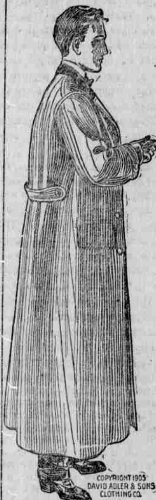
COPYRIGHT 1905 DAVID ADLER & SONS CLOTHING CO. MILWAUKEE.