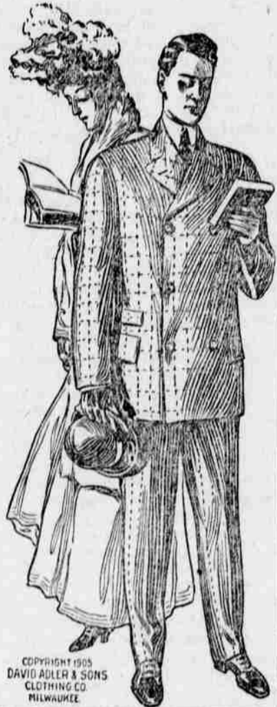
COPYRIGHT 1905 DAVID ADLER & SONS CLOTHING CO. MILWAUKEE