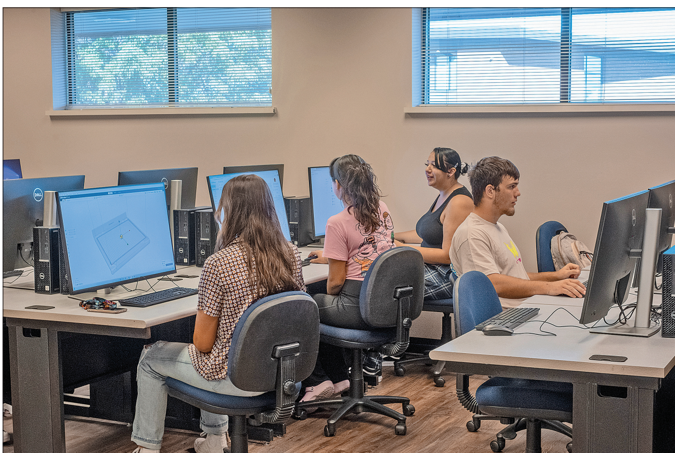
Students work on 3D print mapping Monday, Aug. 29, 2022, at the Think Big Space in Hermiston High School on the first day of the new fall term.

This autonomous 1/18th scale race car is designed to test reinforcement learning models by racing on a physical track. Using cameras to view the track