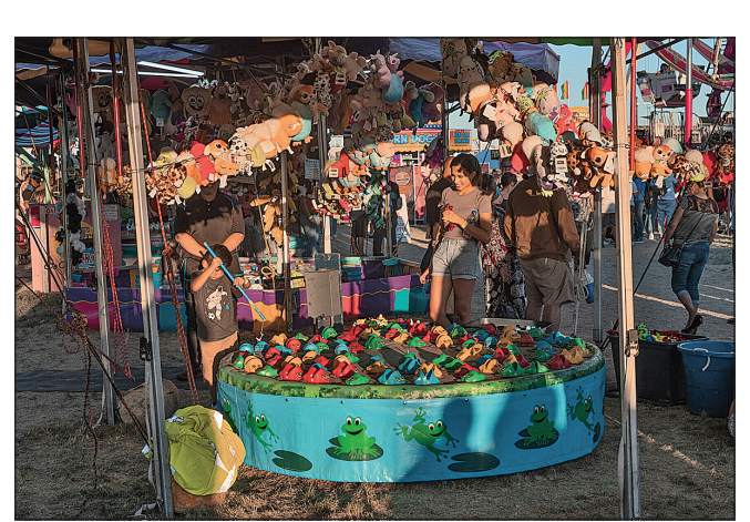
A young boy plays fishing for frogs Saturday, Aug. 13, 2022, and tries to win a toy at the Umatilla County Fair in Hermiston.