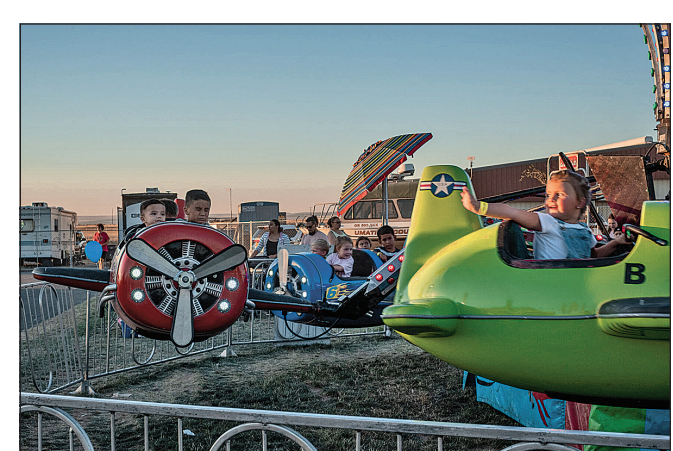
Children take a spin Saturday, Aug. 13, 2022, on the airplane ride at the Umatilla County Fair in Hermiston.