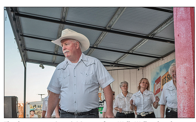
The dance group, Steppin' Country from Walla Walla takes the stage Saturday, Aug. 13, 2022, at the Umatilla County Fair in Hermiston.