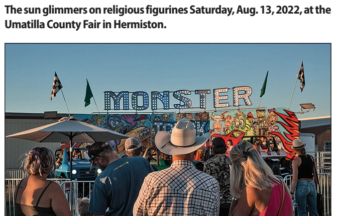
The sun sets as a group of people watch the children on the Monster Truck ride Saturday, Aug. 13, 2022, at the Umatilla County Fair in Herm-