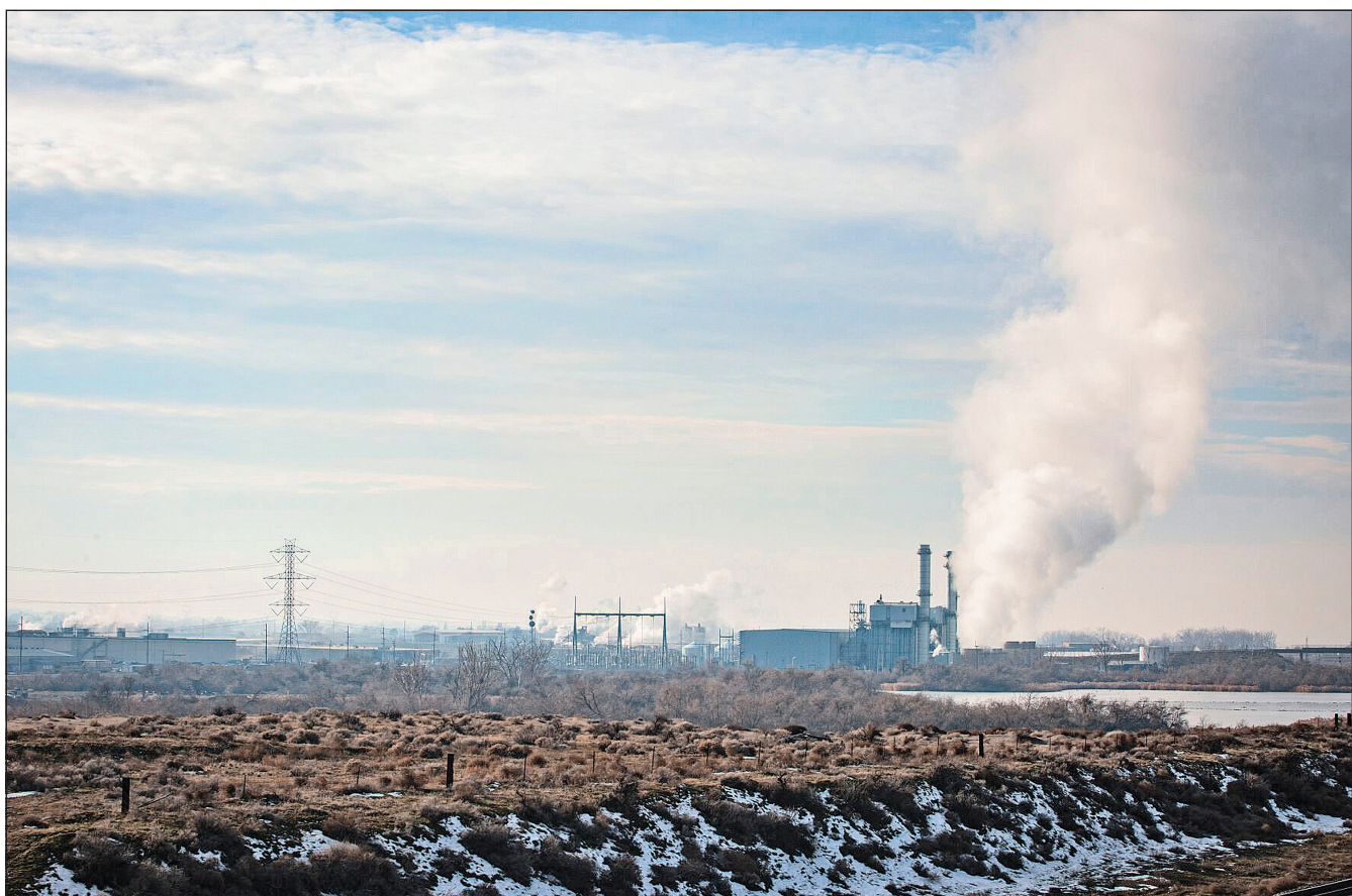
Industrial facilities operate Jan. 11, 2022, at the Port of Morrow near Boardman. Oregon Department of Environmental Quality announced Friday, June 17, 2022, it increased the penalty against the port for nitrate pollution from $1.3 million to a little more than $2.1 million.

The state environmental department also encouraged the port to collaborate with local partners to complete a "Supplemental Environmental Project" that addresses high nitrate concentrations in the drinking water in the groundwater management area. DEQ stated the port could resolve as much as 80% of the penalty through such a project.