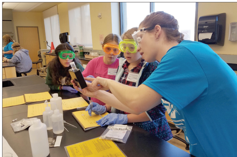
The Eastern Oregon University Chemistry Club will lead hands-on activities for an Earth Day Extravaganza on Friday, April 22, from 3-4 p.m. at Cook Memorial Library in La Grande.