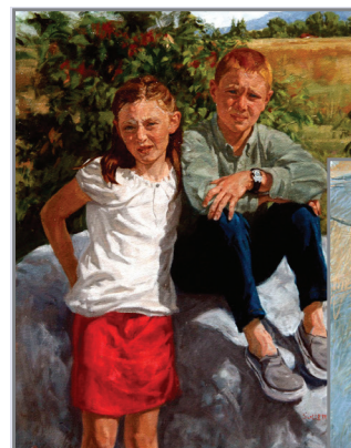
above: Oil, right: Pastel

Tickets on sale now! 541-663-6324 ElginOperaHouse.com