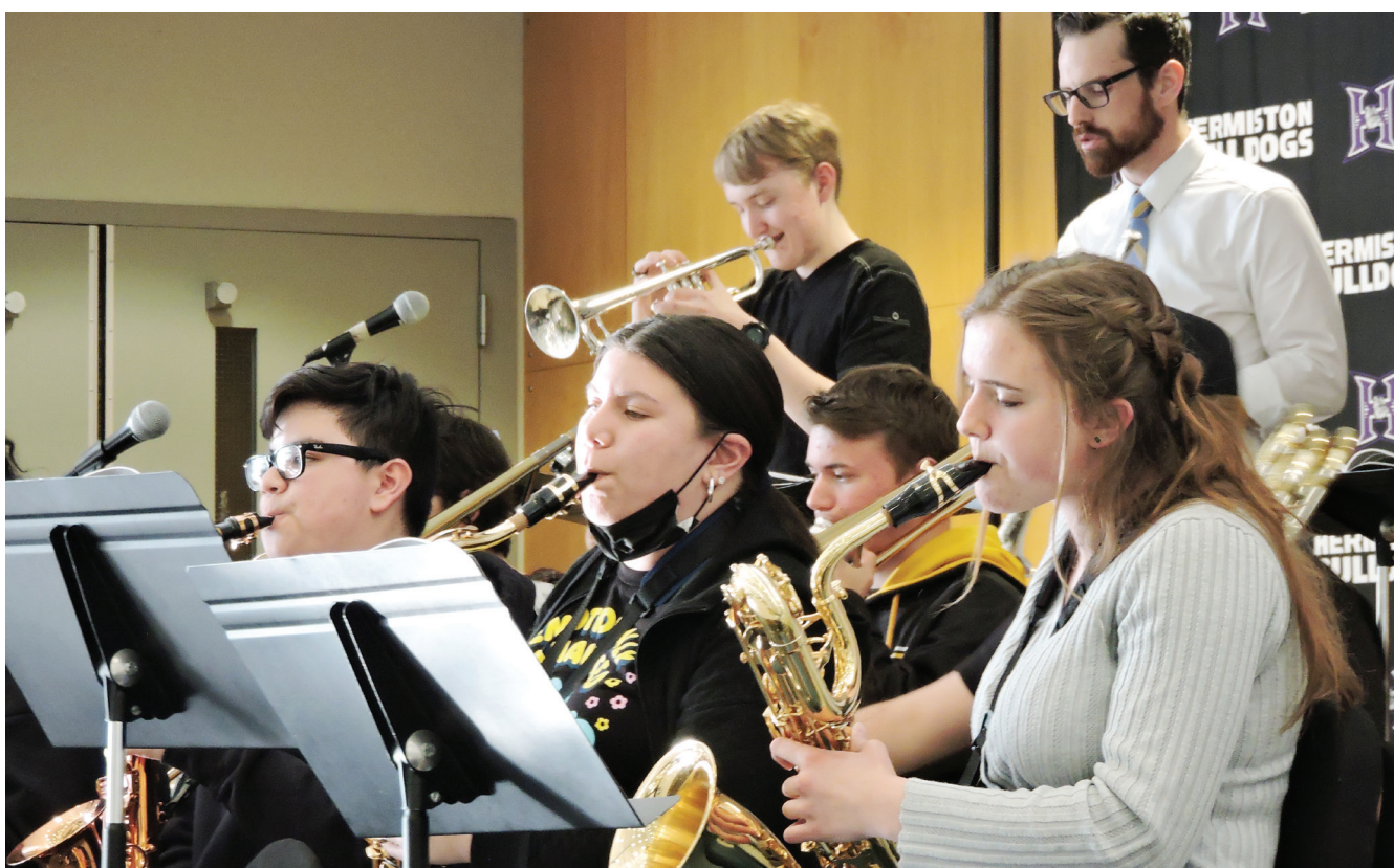
Jazz musicians play March 30, 2022, at Hermiston High School.