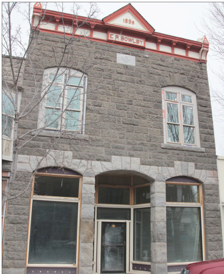
Fishtrap's new home will be in the Bowlby Building on Main Street in Enterprise.