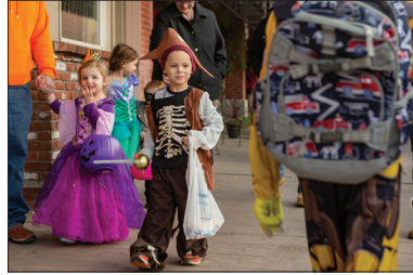
Pendleton's downtown trick-or-treat event is Saturday, Oct. 30, from 3-5 p.m.

• La Grande's Downtown Trick-or-Treat happens on Friday, Oct. 29, from 4-6 p.m. Streets in the heart of downtown (including Adams Avenue from Third Street to Greenwood Street, and all side streets from Washington to Jef-