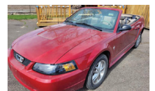
2003 MUSTANG- V6, Convertible, Only 32k Miles!