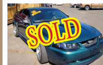
2001 MUSTANG- V8, Leather, Stick Shift, Stage 1 Build!