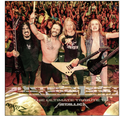
Metallica tribute band Blistered Earth plays at Baker City's Ison House Friday, Sept. 3.

"The word really spread. Eventually it got back to Metal-