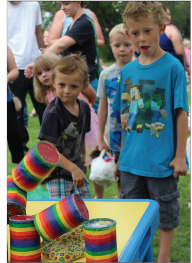
The Observer, file Kids of all ages can find activities at the Grassroots Festival on Aug. 14.

Though there have been sporadic rain showers in the area recently, the fire department isn't taking any chances with the heat and will park their firetruck in the middle of the road with the promise of dousing any patrons who need to cool down.