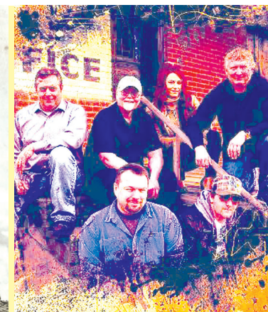
WASTELAND KINGS SATURDAY 4:00pm • 8:00pm