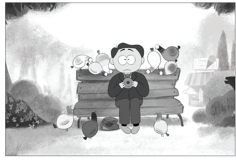
"Pigeon" is featured in the We Like 'Em Short film festival.