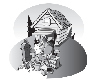
GARAGE SALE? Advertise it here in the classifieds!

Please contact ode.jobs@state. or.us if you have any questions about the application process.