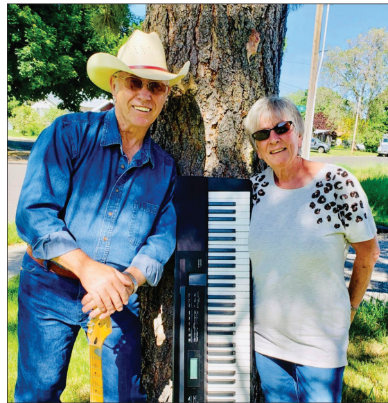
Barefoot & Bonafide plays Saturday, July 31, in Baker City.

Hermiston-based Brass Fire plays jazz, funk, blues, rock and swing in the Eastern Oregon