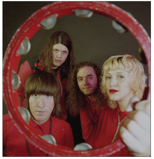
www.facebook.com/theshivas The Shivas

First up is Sun Blood Stories on Saturday, Aug. 7. A band from Boise, Sun Blood Stories describes their music as "high desert psych fuzz" on www.sunblood-