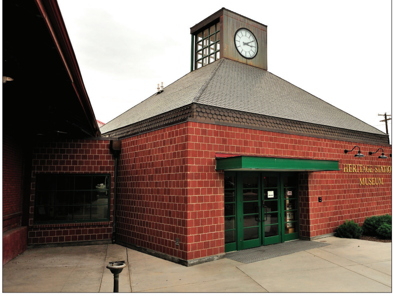
Heritage Station is located in an old train station in Pendleton.

The pancakes tie into the new wheat exhibit, "Umatilla Gold: History of Wheat in Umatilla County." The display features