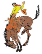
Pendleton High School