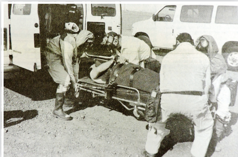
Staff at the Umatilla Army Chemical Depot run practice drills in 1996.

Plans for a cooperative hospital in Hermiston are proceeding at present with a fact finding committee pro-