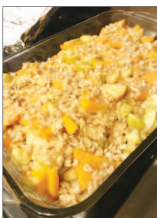
A picture of this butternut squash and apple crisp they made at home for an assignment to cook something with squash in it.

a teacher at Hermiston High School, but she is extremely familiar with teaching cooking, particularly using Food Hero recipes, after years of visiting schools, teaching SNAP education classes to families receiving food stamps and carrying out other educational activities as the Oregon State University Extension Service’s SNAP Education coordinator for Umatilla and Morrow counties.