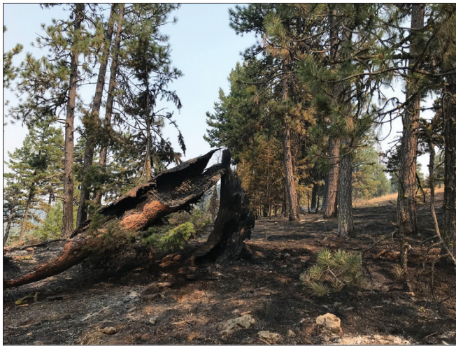
Burned logs remain after the Birch Creek Fire burned through part of the Umatilla National Forest near Ukiah in September 2020.

There have been 40 lightning fires for a total of 127.5 acres. Another 26 fires were human caused