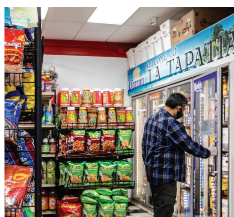
New LED lighting at La Tapatia 2 makes shopping easier for customers while store owners save thousands in energy costs each year.