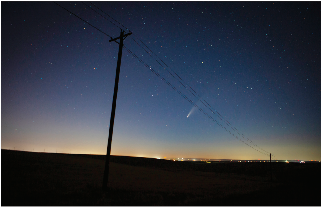
Comet NEOWISE appears in the sky above rural Umatilla County outside of Hermiston on Wednesday, July 15, 2020. The comet, which is visible through the middle of August, can be seen in the northwest corner of the sky beginning roughly an hour and a half after sunset.