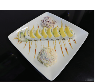
The new La Laguna Sports Bar offers sushi with a Mexican twist.