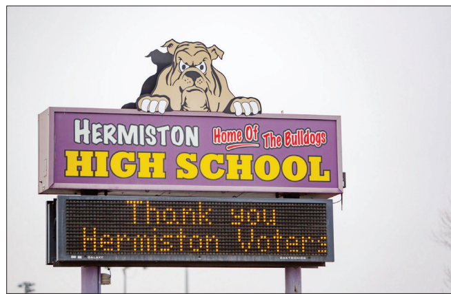
A sign at Hermiston High School thanks voters for their support of the bond that will build a new elementary school on Theater Lane.

Name suggestions can be sent in through an online survey at www.surveymonkey.com/r/TC9GRS2 that will be open throughout the