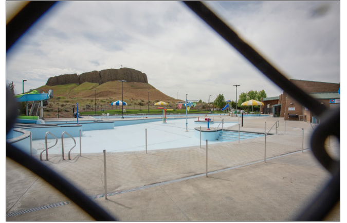
The pools at the Hermiston Family Aquatic Center sit empty on Monday morning in the shadow of Hermiston Butte.

Hermiston's parks remain open in general, however, along with its trails and disc